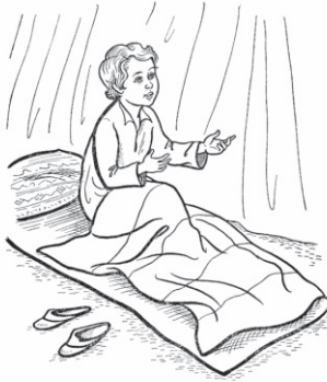
Samuel was called by God and served in the temple from childhood. He was the last of the Judges.